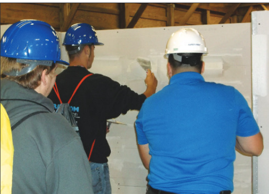
Metro Walls, based in Manchester, N.H., hosts an exhibit to teach students how to hang dry wall.