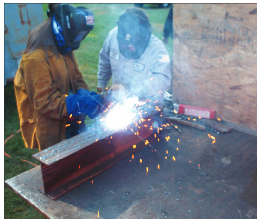
Multi-Weld Services Incorporated of Contoocook, N.H., provides a hands-on welding experience for the students.

various booths and exhibits provided students an opportunity to work with heavy machinery, and try welding, plumbing, carpentry, pouring concrete, land surveying, electrical