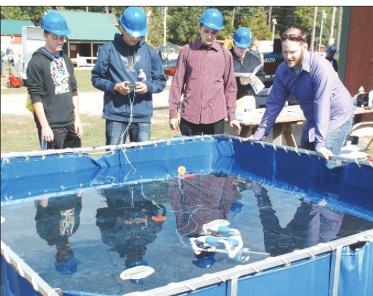
Portsmouth Naval Shipyard provides an opportunity to operate a marine robot that was built by other students, and informed students about apprenticeships they have available to them once they graduate.