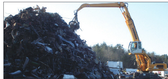
The A934C HD Liebherr material handler makes easy use of its grapple to stockpile and load out scrap metal.