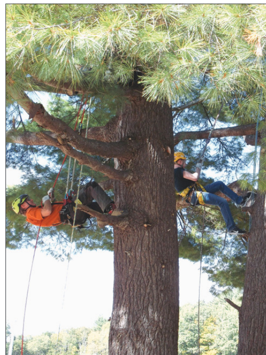
Renaissance Acres in Weare, N.H., hosts an exhibit to educate students about the land clearing industry.