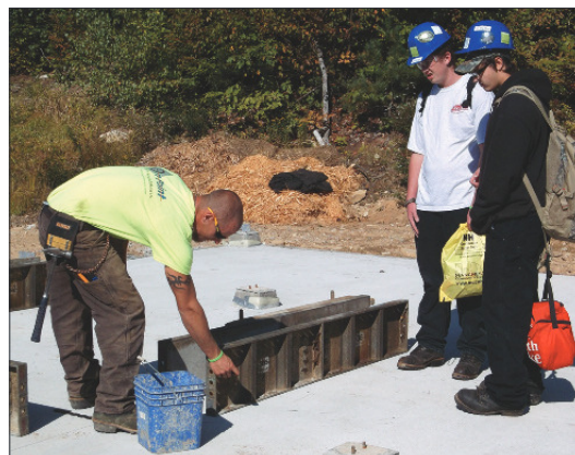
On Point Concrete Foundations shows students the fundamentals of pouring concrete for building foundations.