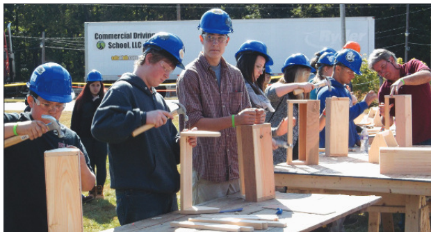
New Hampshire's Carpenter Local Union #118 helps students hammer out their future plans.

More than 900 students participated in the 6th annual New Hampshire Construction Career Days (NHCCD) at the 4-H Youth Center in New Boston, N.H., Sept. 17 and 18. Students from 45 New Hampshire schools registered for the event.