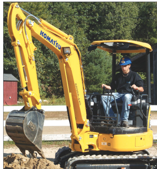
Ander Equipment allows students to operate its Komatsu excavator.

(This story also can be found on Construction Equipment Guide's Web site at www.constructionequipmentguide.com .) CEG