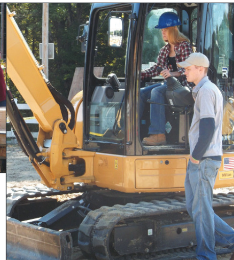
Milton CAT and White Mountains Community College partnered for the event, which gave students the opportunity to operate heavy machinery.